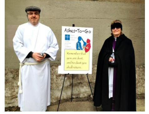
Ashes to Go 2014

As you can see the first ninety days have been filled with much work and many exciting changes and developments at Christ Church. We are laying the foundation to enable our congregation at Christ Church to grow and meet the needs of our surrounding communities. It is a honor and pleasure to be one of your Wardens and please let me know if I can be of assistance or help to you at any time.