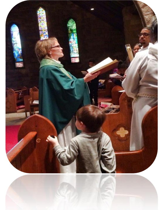
"To you and to your service I devote myself, body, soul, and spirit." (BCP p.562 from the liturgy for new ministry)

BE IT FURTHER RESOLVED, that Christ Church in Bloomfield & Glen Ridge will promote and encourage energy conservation and awareness in the Christ Church community and beyond; and